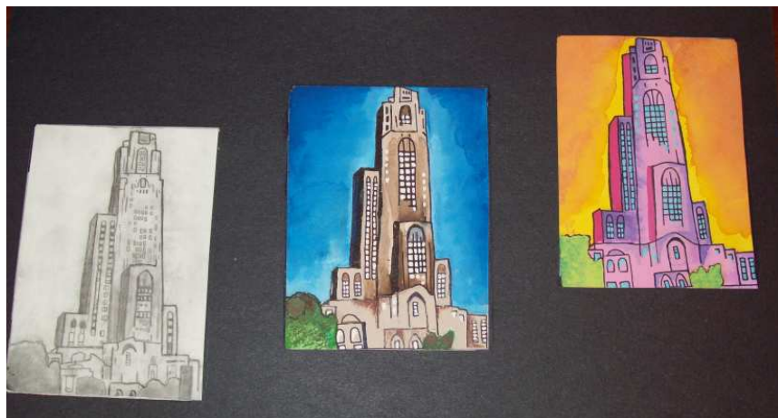
Maddie Bucci's watercolors