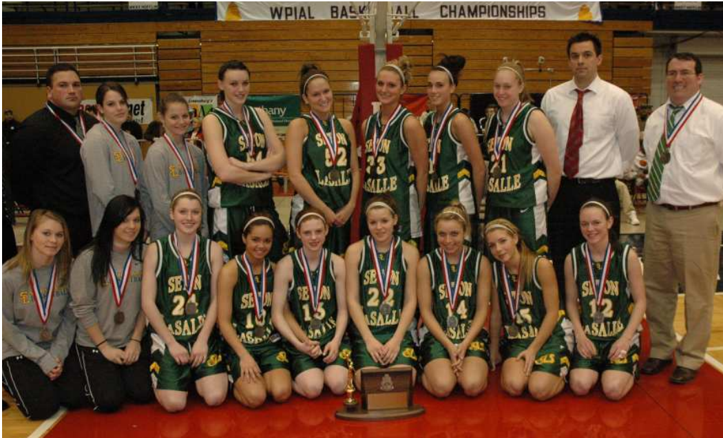
2008 WPIAL Runners Up