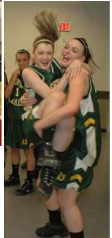
We're in the Championship!