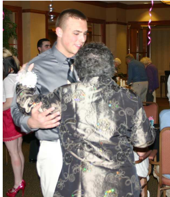
Last year's "Junior-Senior Prom" was a wonderful success