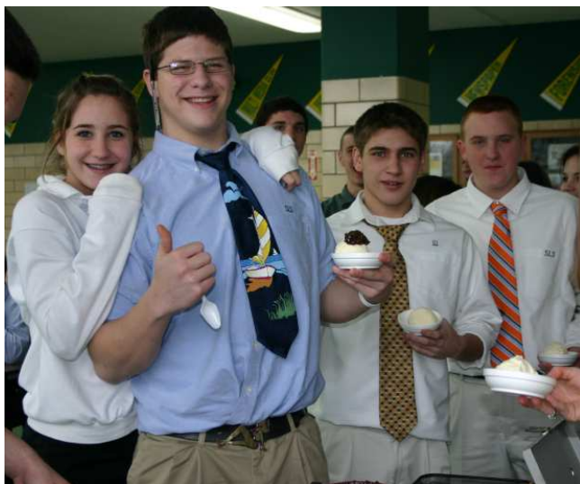
Students enjoy their sundaes from the Ice Cream Social