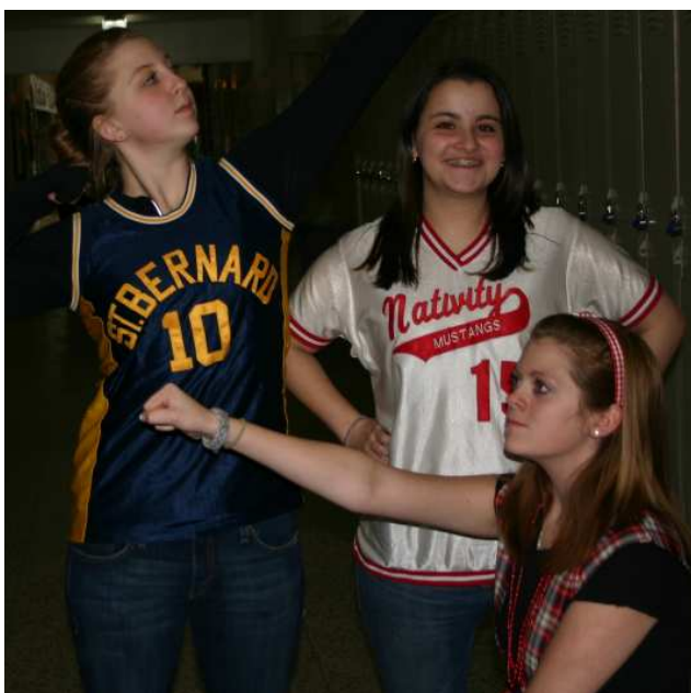
Students show their school pride

Thursday was the annual Variety Show and Green and Gold Dress Down Day. The week culminated with an ice cream social and a dress down day for the benefit of the victims in Haiti. All in all, a great week!